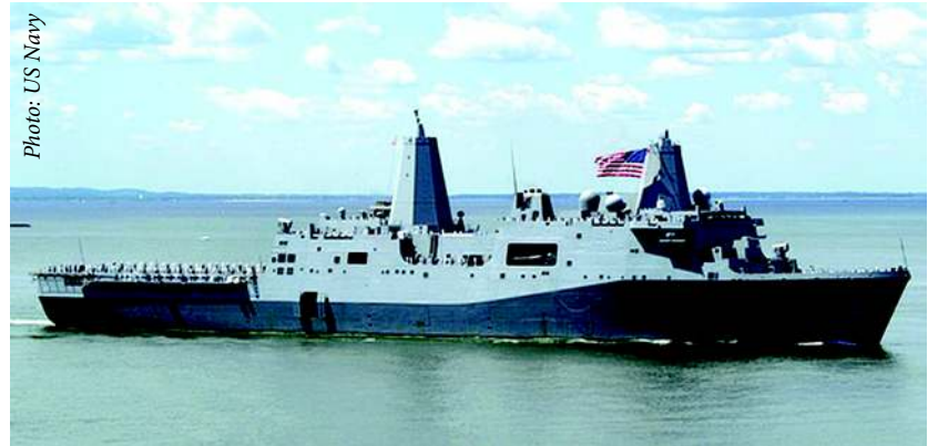
USS San Antonio, a capability some in Canada would like to see acquired.

During visits to Canadian Forces College in the past decade, I've followed the Canadian Navy's post-Soviet search for its proper role, but here – with one exception – I will stick to the US Navy's (USN) struggle. The exception is a personal opinion. It is my suspicion that the Canadian armed forces, after many years of planning for NATO operations in the Atlantic and Europe, could easily underestimate the cost of delivering forces and supporting them in littoral operations overseas. European armed forces – who are accustomed to defending their homelands from their homelands – have