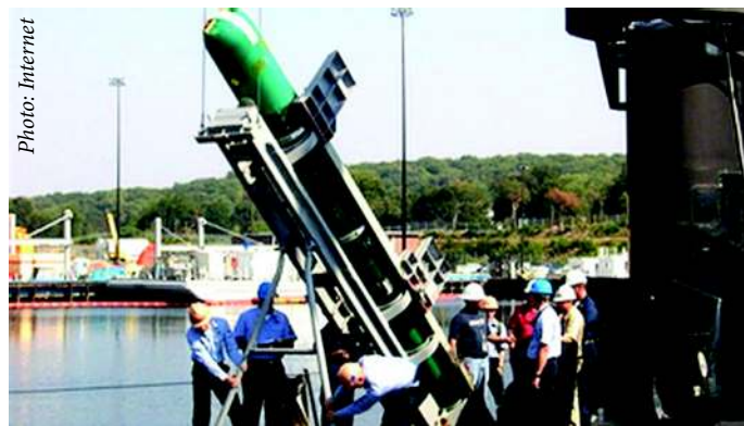
An autonomous underwater vehicle (AUV) being loaded into a US Navy submarine. Is this a capability Canada should acquire?

Third, missile era combat has been fought entirely in coastal waters. The winner is the side with better detection, tracking and targeting, combined with (especially) soft kill defence. ‘Attack effectively first’ is still a sound maxim of all naval combat.